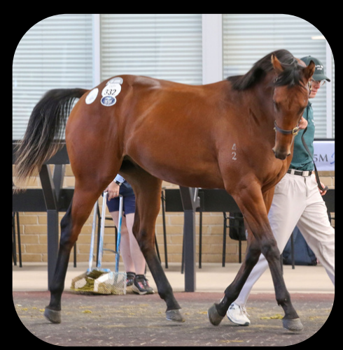
Lot 332 Inglis Premier Ole Kirk x Kibibi Colt

Willow Grove Stud knocked it out of the park with their outstanding Ole Kirk x Kibibi Colt, after a spirited bidding duel the colt eventually sold to B&J Racing NSW for $400,000 making him the second most expensive Ole Kirk colt sold this year for first season stallion. Willow Grove sold 3 yearlings and finished in the top 10 leading vendors achieving an average of $175,000.