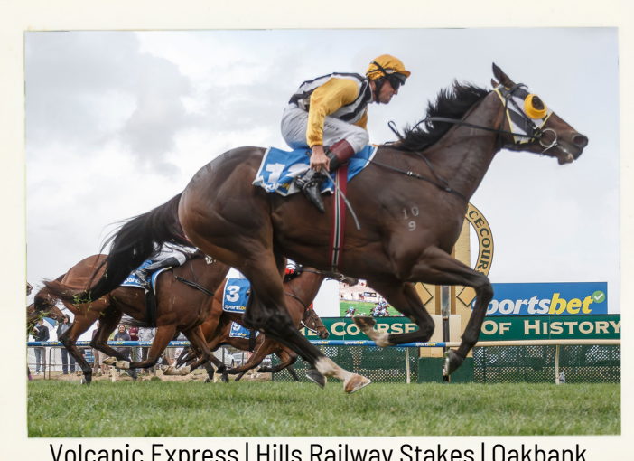
Volcanic Express | Hills Railway Stakes | Oakbank

We eagerly anticipate the fierce competition in the upcoming two weeks of the Sportsbet Adelaide Racing Carnival and cheer on our SA Bred competitors.