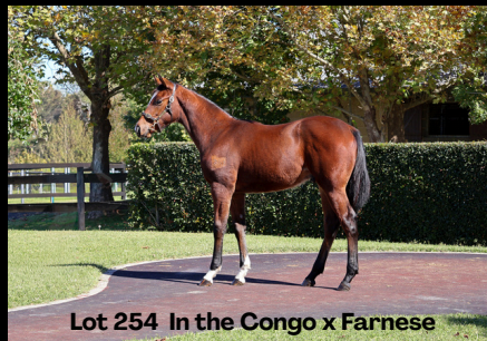
Lot 254 In the Congo x Farnese