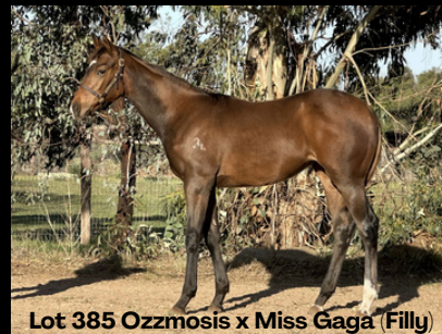
Lot 385 Ozzmosis x Miss Gaga (Filly)