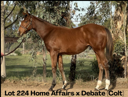
Lot 224 Home Affairs x Debate (Colt)