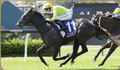
Moxie winning the Gr.2 Al Basti Equiworld Dubai Classic (1400m) at Ellerslie on Champions Day.

Great results being achieved in New Zealand with Moxie. The second stakes-winner for I Am Invincible stallion Strasbourg, she has gone on to win five of her 11 starts to date and has earned just shy of $500,000 in prizemoney. –