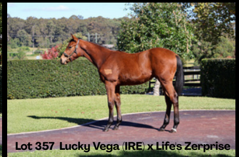
Lot 357 Lucky Vega (IRE) x Life's Zerprise