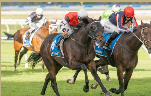
Mating Call & Freedom Flame