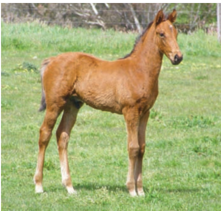
31/08 B C MINT LANE - LIFTING (NZ)