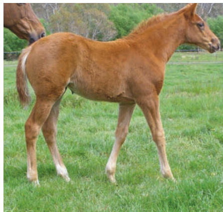
26/08 CH F MINT LANE - REELIA GAME