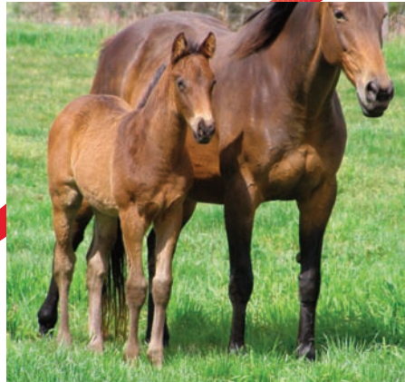
26/08 BR C MINT LANE - WAY TO GO RUBY