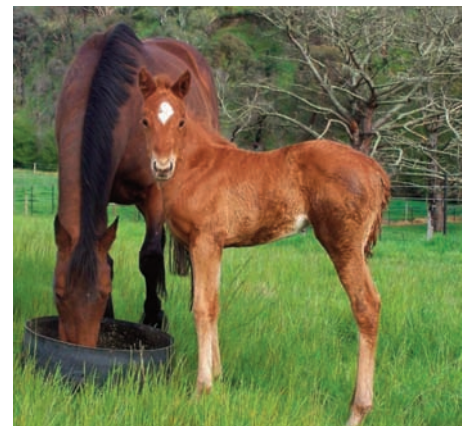
12/09 CH F GOOD JOURNEY - CZARPUSSY