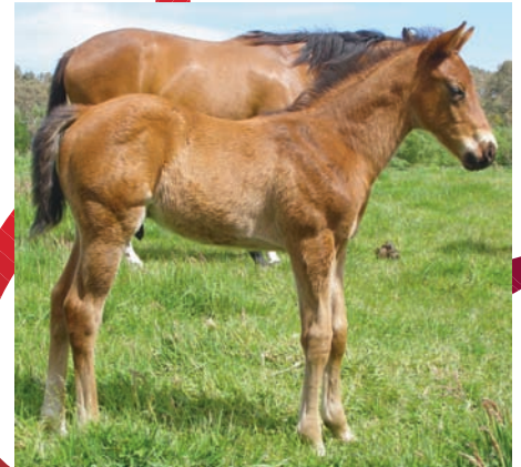
10/09 BR C MINT LANE - WINGS OF ALICE