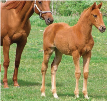
02/09 CH F MINT LANE - SHALINI